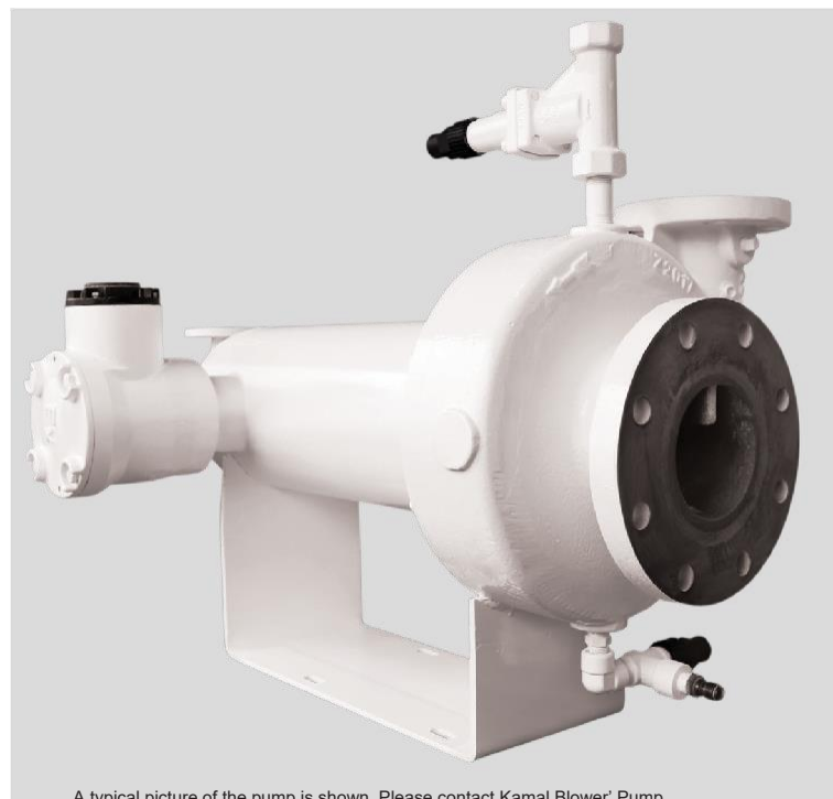
A typical picture of the pump is shown. Please contact Kamal Blower Pump Company for further details. All information is approximate and for general guidance only.